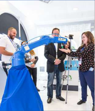
Hands-On Tech Demos

Throughout the venue, attendees have the chance to interact with some of the coolest technologies on the market – or not yet on the market. From virtual reality to medical diagnostic devices to consumer products, it's a chance to personally experience the future.