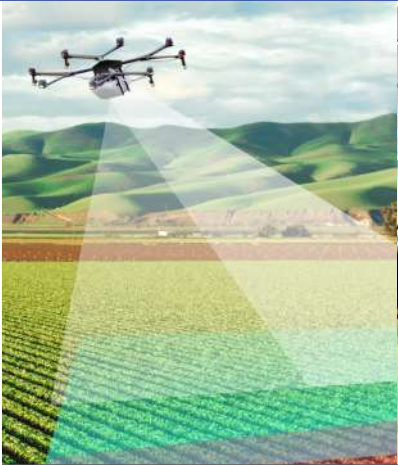
AgriFood Tech Circle

See the past, present, and future of startup innovation from Israel and beyond. Gain insight into ten key sectors, with a review of cutting-edge companies from the portfolio of the most active investor in Israel.