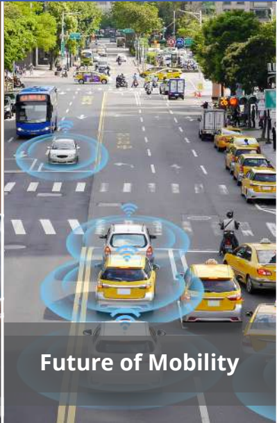
Future of Mobility

Honda hosts a preview of where the world of tech-driven transport is heading, with a full-size connected race car and a full-size motorcycle demo of predictive vision - and more! Sponsored by Honda Xcelerator