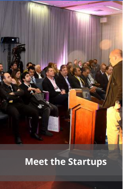
Meet the Startups

The entrepreneurs behind the most exciting tech startups anywhere present updates on their companies throughout the day.