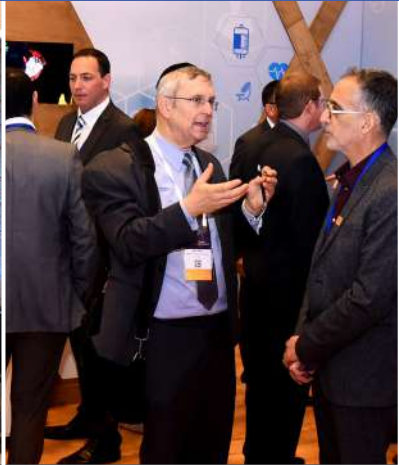
OurCrowd Business Hub

Take an exhilarating stroll through some of the most forward-thinking, hands-on, and effective NGOs and nonprofits in the world – and get involved!