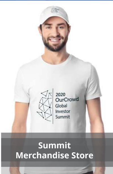
Summit Merchandise Store

Come by the OurCrowd exhibition space and take home memories of the Summit. Items on sale include shirts, hats, chargers, and books about Israel and innovation. Famous authors will be on hand to sign your books personally!