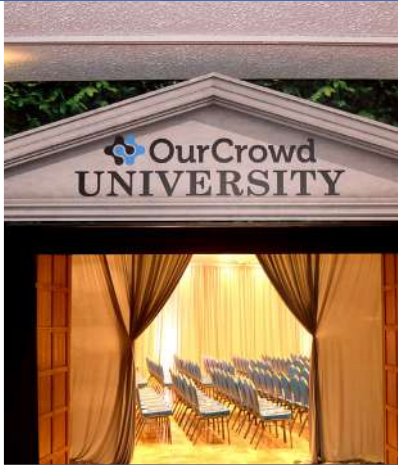
OurCrowd University for Investors

MBA-style courses taught by professionals in each topic area will help startup founders and executives expand their global perspective and lead at a higher level. From managing cash flow and scaling up to entering foreign markets and undertaking an IPO, this is a can't-miss opportunity to gain a working knowledge of business practices essential to success.