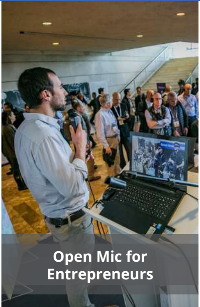
Open Mic for Entrepreneurs

From the beginning of the breakout sessions through lunch, OurCrowd is providing a microphone and a screen for startup hopefuls to win over an audience. It's Hyde Park Speaker's Corner for global tech dreamers.