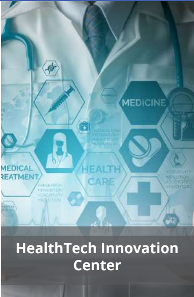
HealthTech Innovation Center

Go beyond anything you thought you knew about healthcare, and interact with the technology that is extending lifespans and improving quality of life. Get your blood checked, brain mapped, body screened, and more with cutting-edge MedTech and Digital Health startups. Sponsored by Yigal Arnon & Co. Johnson & Johnson, Halma.