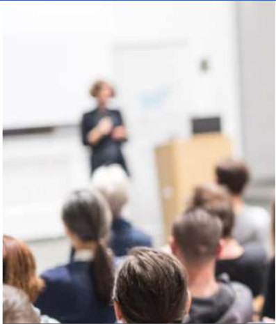
OurCrowd Entrepreneurs Academy

Responding to demand, this space is dedicated to high-level education and meetings, including: The OurCrowd Entrepreneurs Academy (open to all attendees); the OurCrowd B2B Room, with facilitated meetings for portfolio companies and corporate executives; and private meeting lounges hosted by Summit partners. More than ever before, the Summit is “where business gets done.”