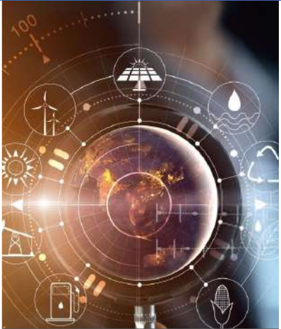
OurCrowd Innovation Zone

Take a break from the packed program and the tech-filled halls in this space dedicated to meeting, interacting, and doing business with other Summit attendees. Hosted by Sompo Digital Lab.